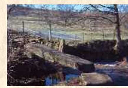
Ancient Clam brid