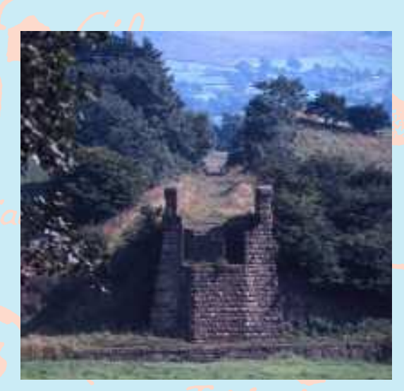
Old Barnoldswick to Earby railway

The Pendle Way covers a variety of terrain and you are likely to encounter some muddy stretches. Weather conditions can change suddenly so be prepared for all eventualities.