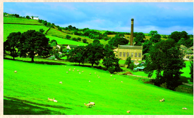
Bancroft Mill. Barnoldswick.