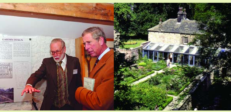
HRH The Prince of Wales in the Garden Museum on his visit to Pendle Heritage Centre, 24 October 2003.