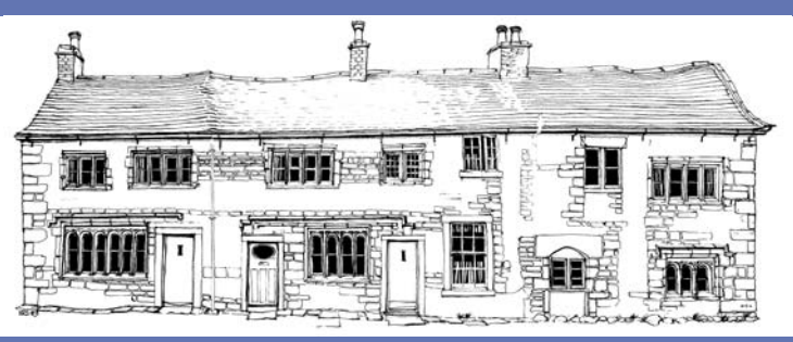
The Fold, Higherford: This 16th century farmhouse has been converted into 4 cottages. From an original drawing by Kit Smith.

Heritage Trust for the North West is a registered Building Preservation Trust and was established in 1978 as a charity and company limited by guarantee (no. 508300). The Trust seeks to find new appropriate uses for historic buildings at risk and encourages good design and craftmanship. It has retained some of the buildings it has restored deriving rental income from them. Others are open to the public forming a network of historic places to visit. Pendle Heritage Centre, established in 1977 is one of the Trust's flagship projects, attracting over 100,000 visitors per annum.