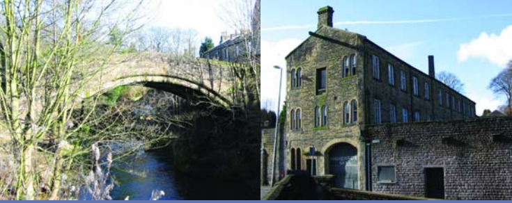
The old Pack-horse Bridge in Higherford.