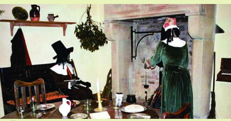
The Hearth setting in the Museum.