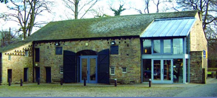
Park Hill Barn and Pendle Arts Gallery.