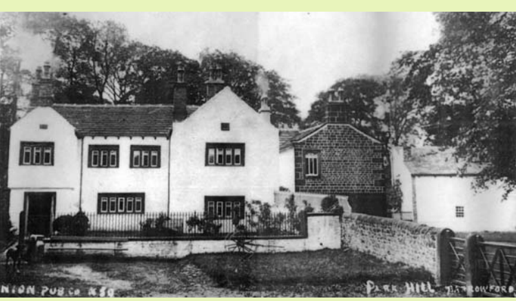
Park Hill and Barn c1900 when both buildings were limewashed.

ituated beside an ancient crossing of Pendle Water, this group of attractive Listed Grade II farm buildings and walled garden, only a mile from the M65, offers the ideal day out for the whole family, and the perfect base from which to explore the Pendle area either on foot or by car.